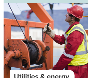
Utilities & energy

Approximately 5,000 Ascom d63 mobile devices are helping managers at 1,800 restaurants keep front and back of house communication and curbside service running smoothly at some of the most recognizable and successful restaurant brands in full-service dining in North America.