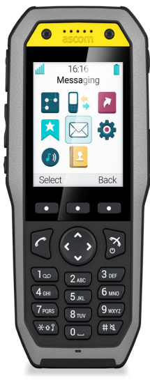
Ascom d83 EX