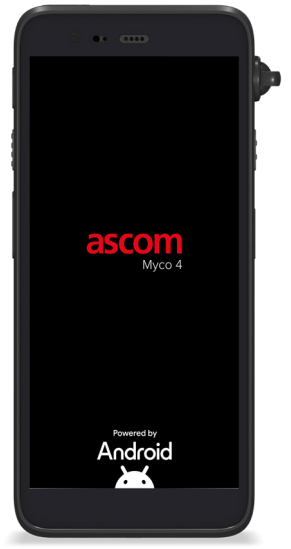
Ascom Myco 4