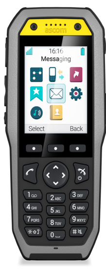
Ascom d83 EX