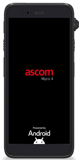
Ascom Myco 4