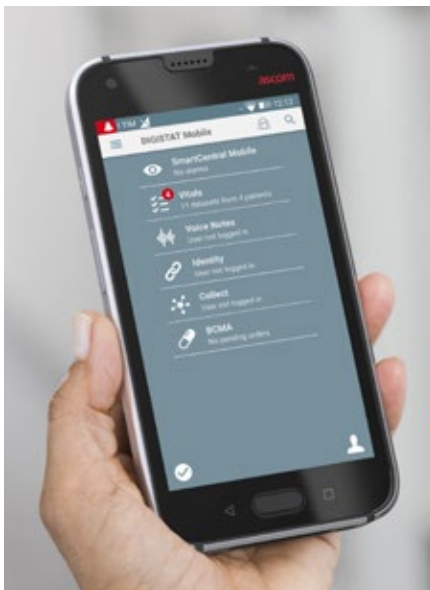
Giving healthcare professionals the tools and data they need, wherever they are.

Help ensure data, alerts and assessments go with them